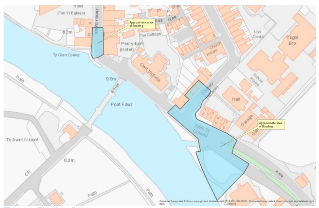
Figure 6 - Flood Outline

Figure 6 below shows the rough area of flooding within Conwy Terrace and the adjacent area: