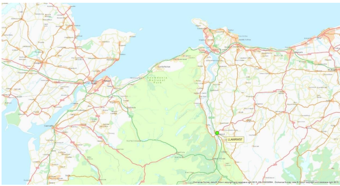
Figure 1 - Location Map

Llanrwst is located on the banks of the Afon Conwy approximately 20 Km south of Conwy Town and the mouth of the Conwy Estuary