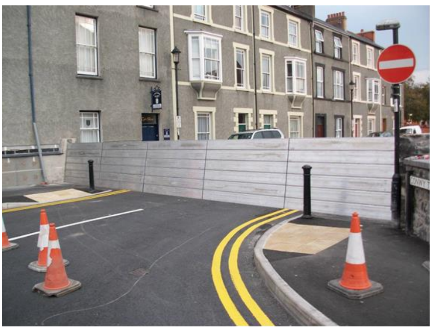
Figure 4 - Conwy Terrace Demountable Defence