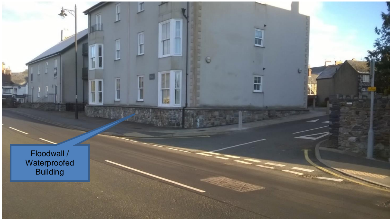
Figure 5 - Floodwall / Waterproofed Building