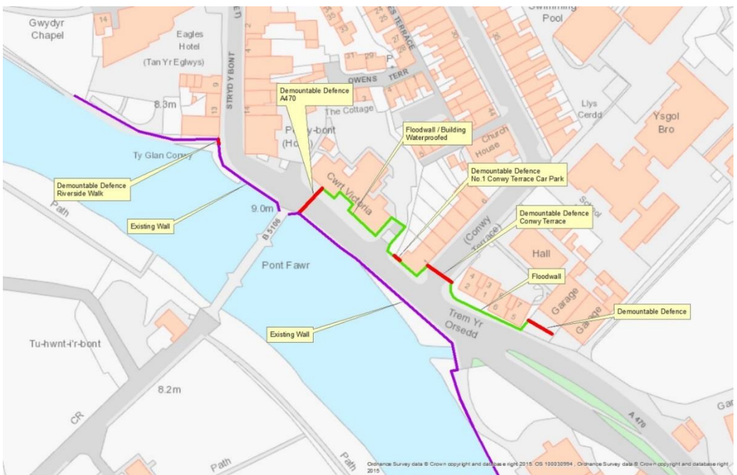
Figure 2 – Existing Defences

Figure 2 below shows the arrangement of the scheme flood walls and demountable defences in Llanrwst.