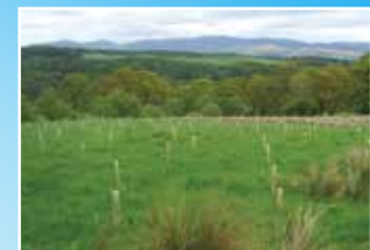
Crairieknowe, Auchenhessnane and Holm of Drumlanrig.

'For us, the income stream has enabled developments and improvements to the estate's natural assets, and the projects sustain local employment.'