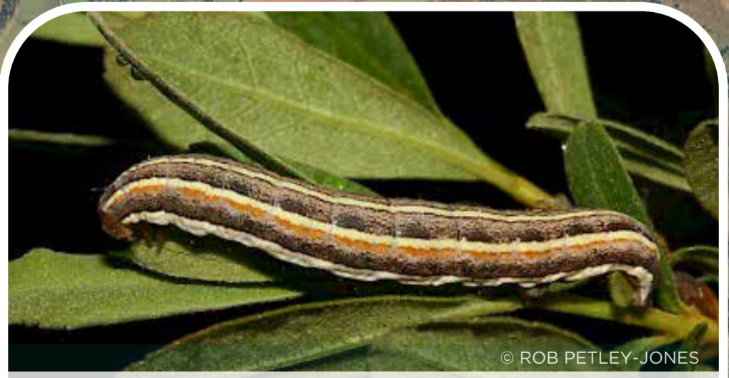
lindsyn gwrid y gors rosy marsh moth caterpillar

You can also access the Riverside Walk from here, either turn left to join it clockwise via the Cors Caron Walk , or turn right to join it anti-clockwise via the Old Railway Walk .