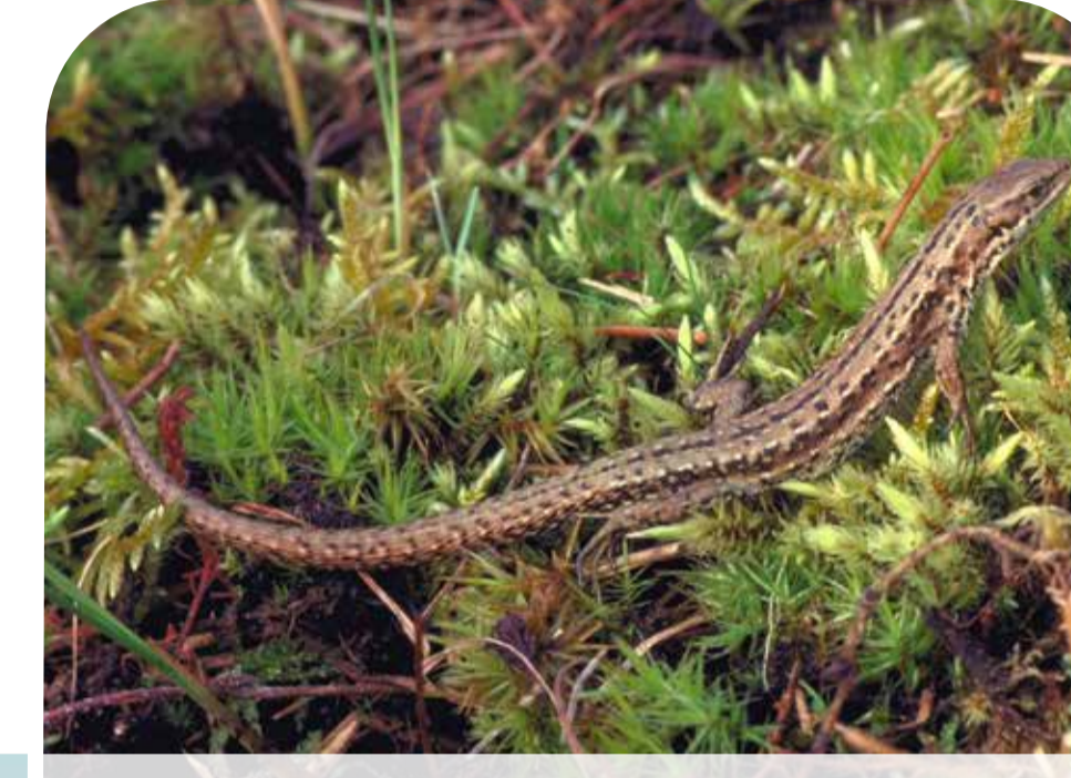
madfall common lizard