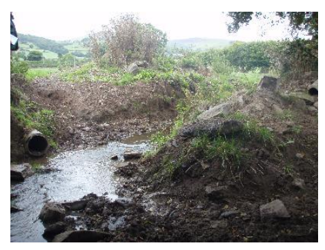
Bankside erosion at Plas yn Rhal