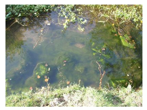
Algal Growth in a tributary of the Clwyd