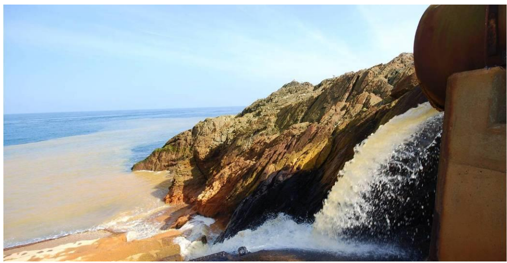
The Afon Goch and Parys mountain copper mine discharge to the Irish Sea

River basin planning gives us the opportunity to review progress and set future priorities for a remediation programme for both metal and coal mine waters in Wales. There is no simple solution. Commitment will be needed to fund sustainable and cost effective long-term treatment for the most polluting mine waters.