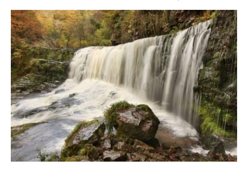
Sgwd Isaf Clun-Gwyn, Afon Mellte