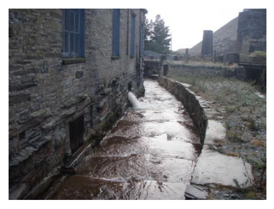
Afon Barlwyd in Blaenau Ffestiniog