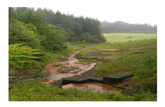
Parc Lead mine near Llanrwst