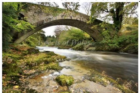
Pont Dolauhirion, Afon Tywi