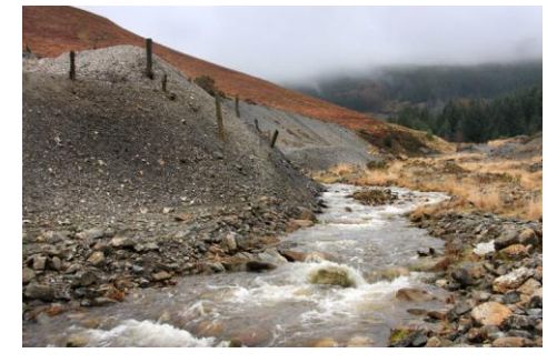
Nat-y-Bai at Nant y Mwyn lead mine