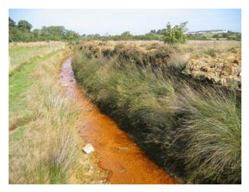
Minewater in the Afon Goch Amlwch