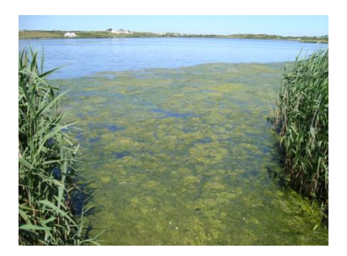
Algal growth in Llyn Maelog