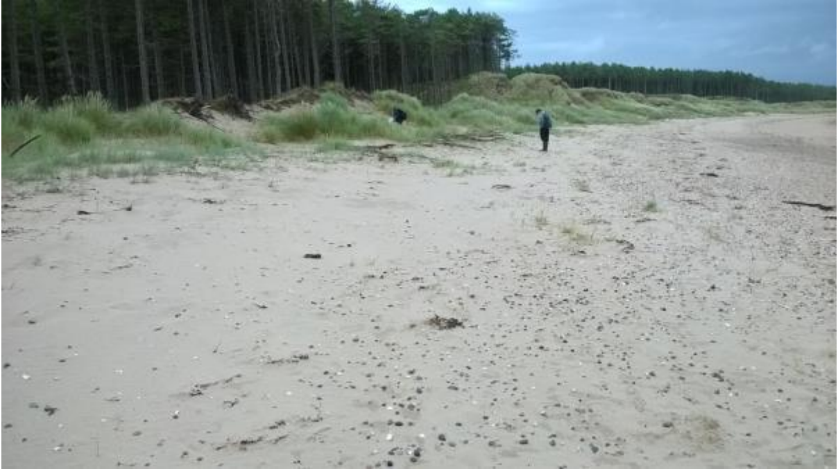
Figure 24: New growth can be seen in this lower view of the west end of Ro Bach on 31 st August 2016.