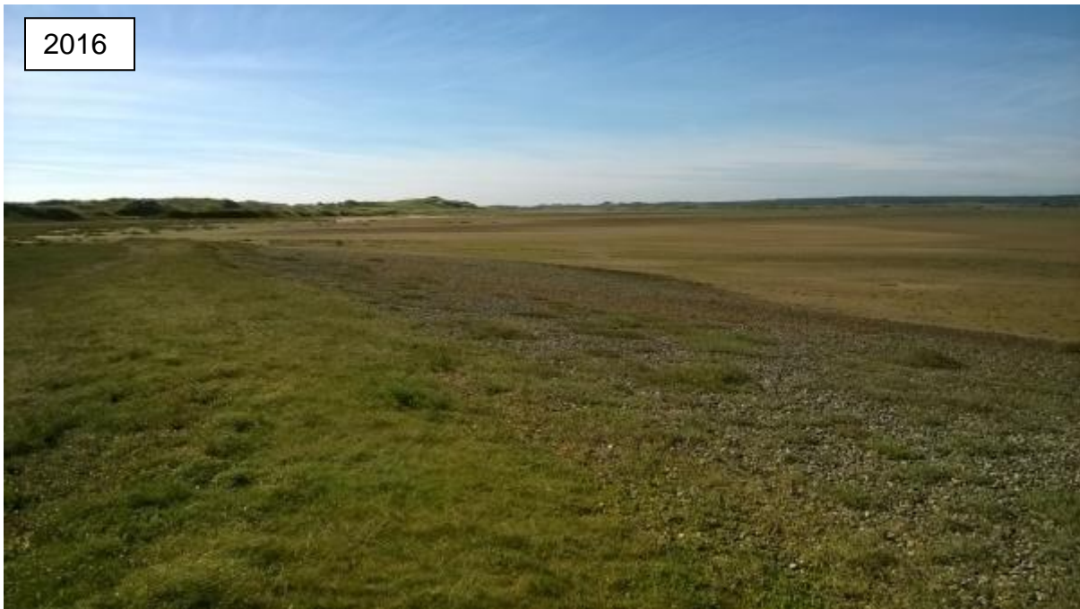
Figure 9: Looking west towards Penllyn Pysgod from Abermenai with the dunes of Braich Abermenai on the left. There seems no significant difference in habitat between the upper view taken on 29 th August 2016 and lower in August 2010.