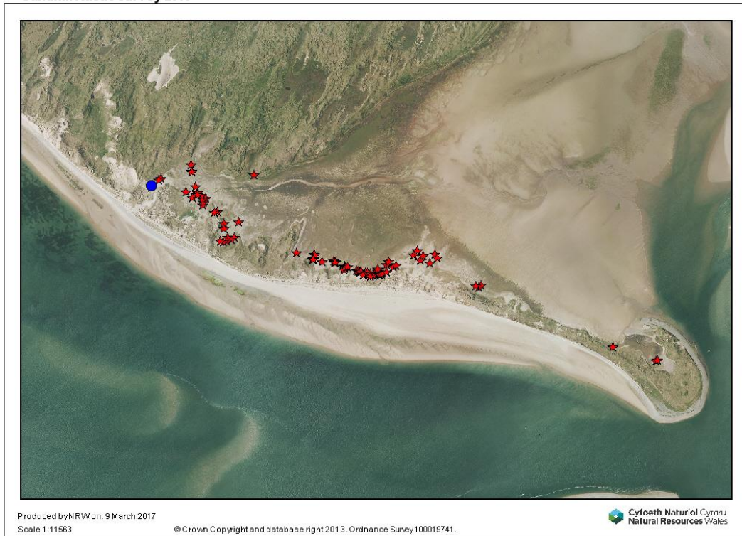
Figure 3: The distribution of Sandhill Rustic at Penllyn Pysgod and Braich Abermenai on Newborough Warren in 2016. Red stars = 2016 records, blue circle = Ian Sims light trap record in September 2014.