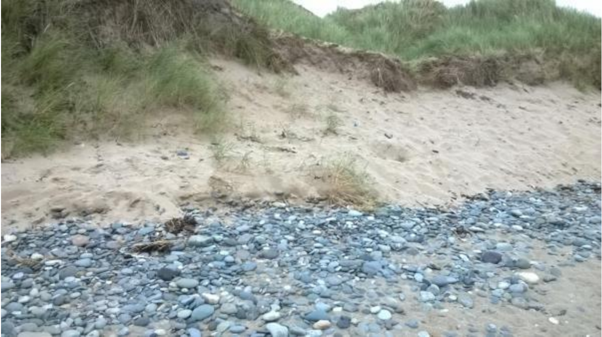
Figure 21: Seaward face of Traeth Llanddwyn on 31 st August 2016 showing no fore dune.