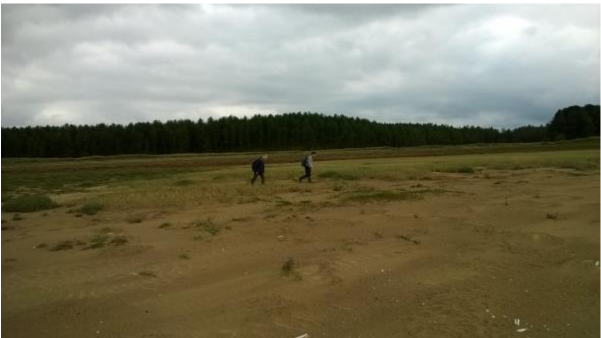
Figure 6: An area of young sand couch grass abutting saltmarsh vegetation at the southwest end of the Cefni saltmarsh, being examined by Brenda and Matthew Wallace on 28 th August 2016.