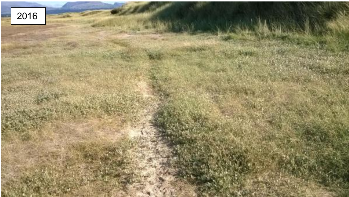
Figure 12: An area at the back of Braich Abermenai where sand couch grass and sea purslane grow together and in patches. There appears to be generally more sand in the view of 29 th August 2016.