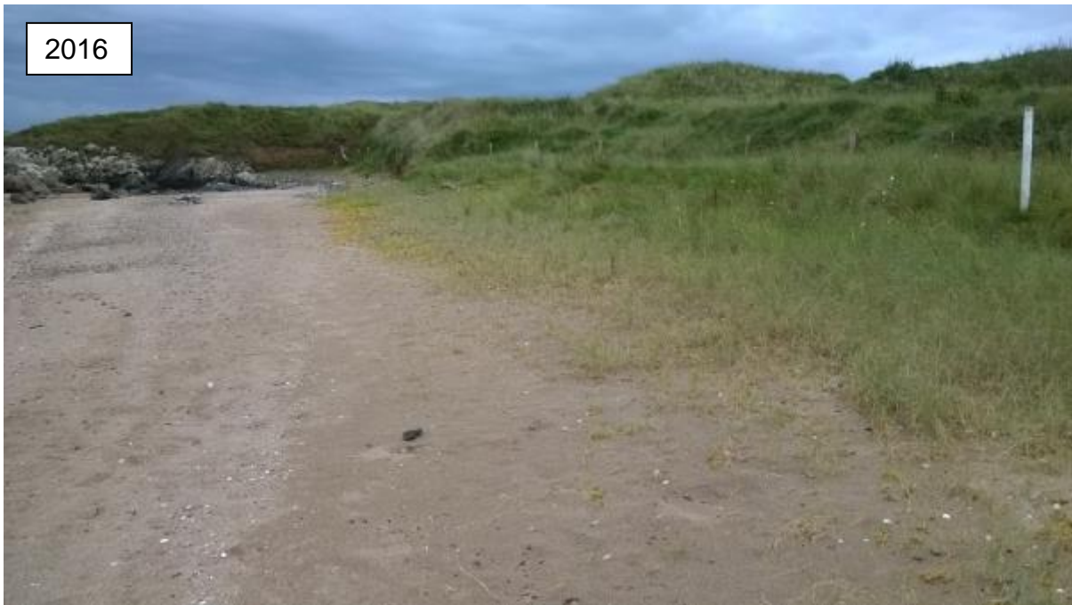
Figure 26: There is no evidence of damage to the sand couch grass at Porth y Cwch on Llanddwyn Island, when comparing August 2010 with August 2016.