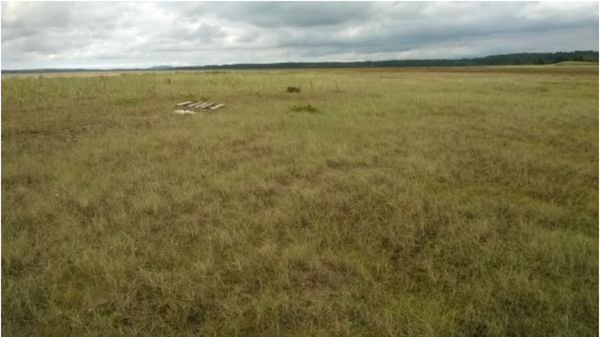
Figure 7: Older sand couch grass at the south western end of the Cefni Saltmarsh looking east on 28 th August 2016.