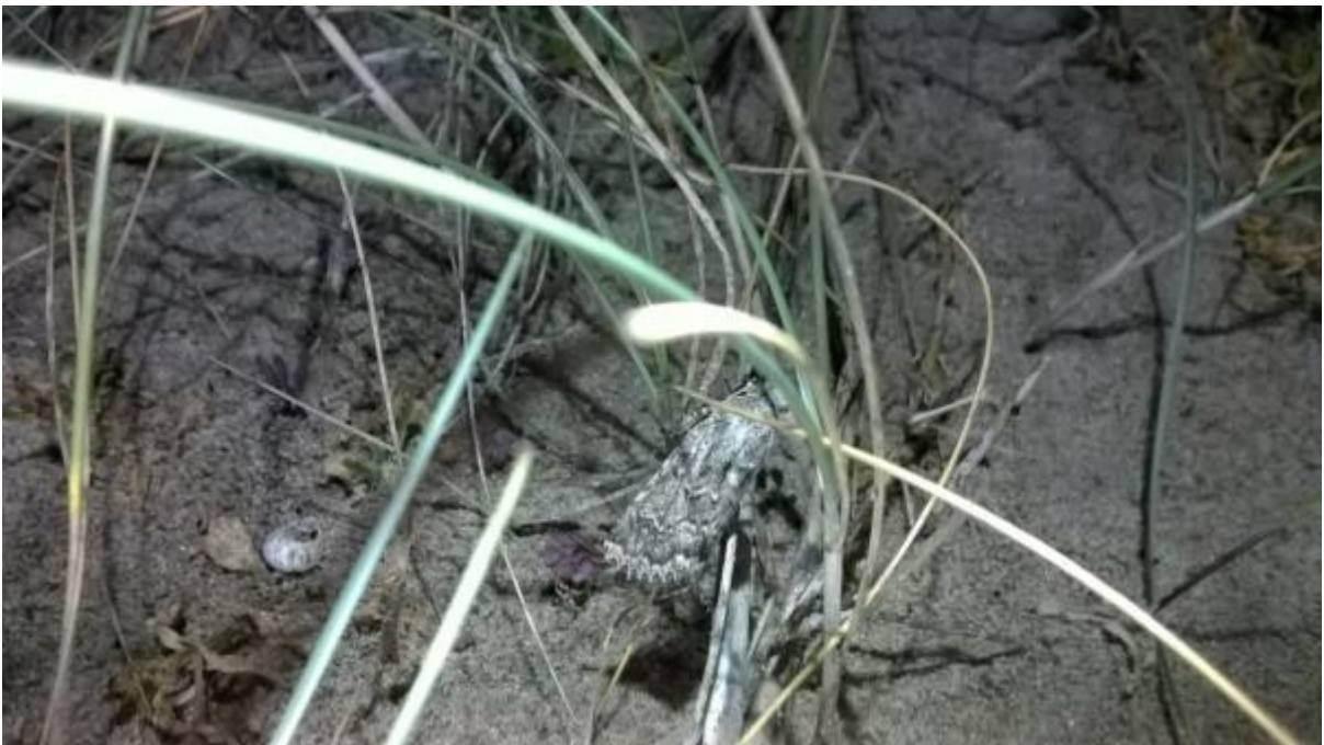
Figure 25: One of the 121 Sandhill Rustic moths seen between Abermenai Point and Penllyn Pysgod in 2016 by the authors.