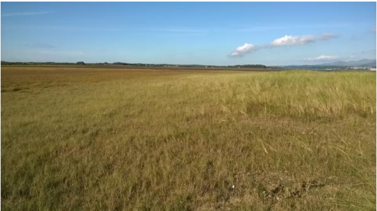
Figure 16: Sand couch grass dominating a low mound of sand in Penllyn Pysgod on 29 th August 2016.