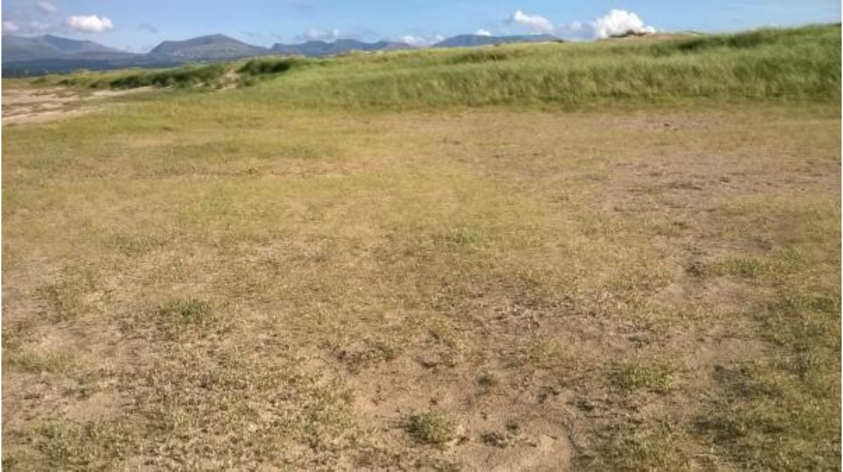
Figure 15: An extensive area of sand couch grass amongst salt marsh vegetation on a dead flat area behind Braich Abermenai on 29 th August 2016.