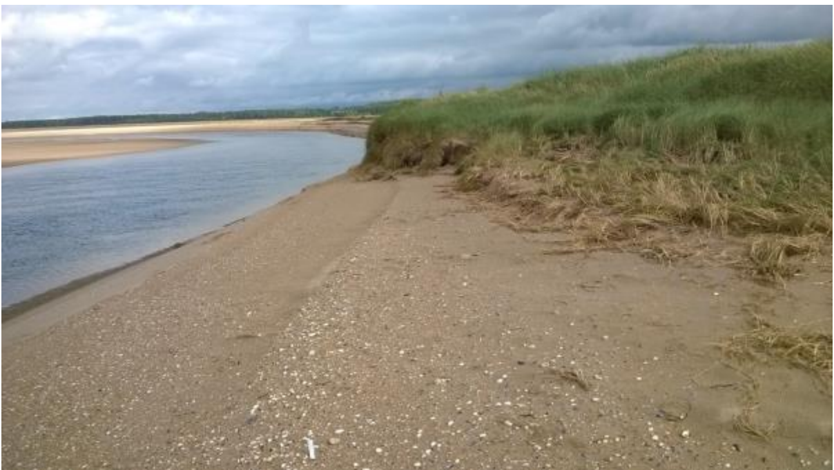
Figure 8: Dunes being cut back by the meandering channel of the Afon Cefni looking east at mid-tide on 28 th August 2016.