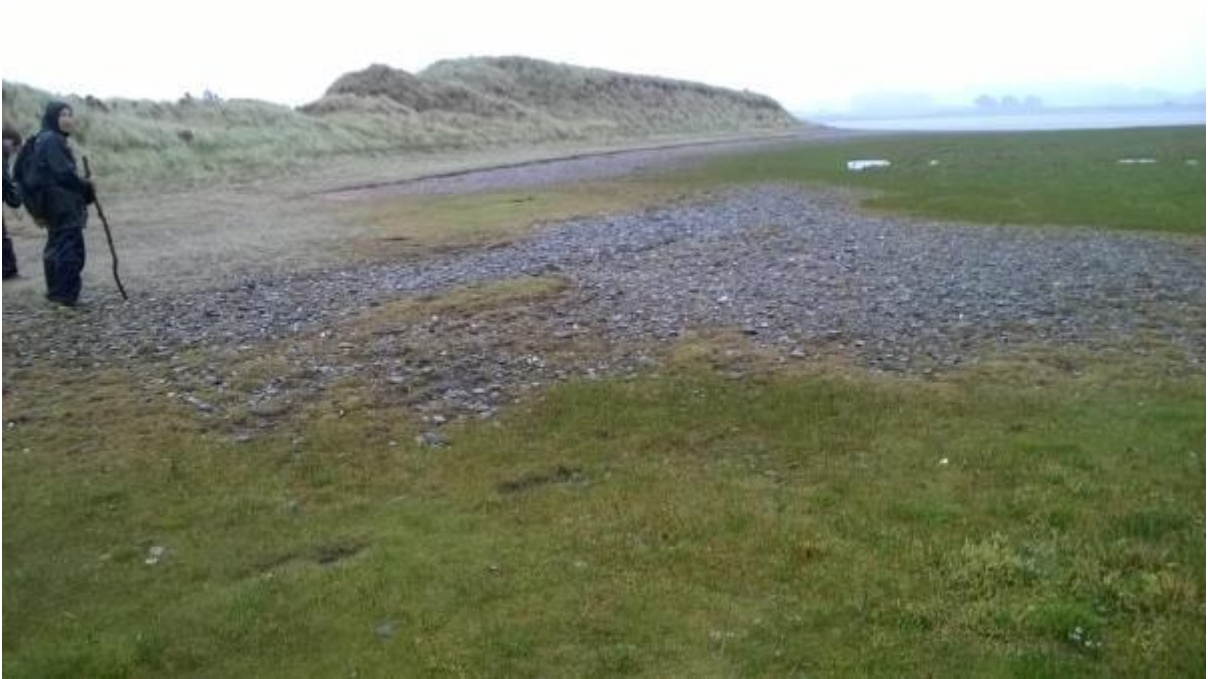
Figure 27: Surveyors Matthew and Brenda Wallace bleakly contemplate the small fringe of sand couch grass behind the fore dune near Fort Belan on 3 rd September 2016.