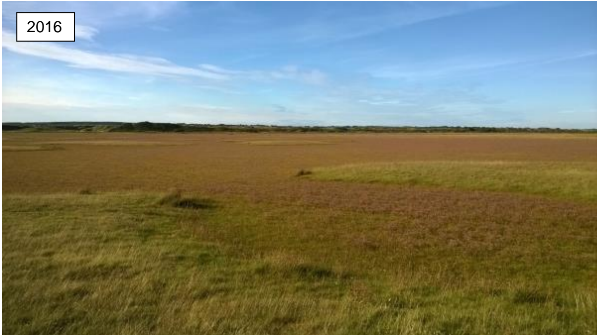
Figure 18: This picture of low sand mounds amongst saltmarsh in Penllyn Pysgod on 29 th August 2016 seems to show the same proportions of different habitats as in August 2010.