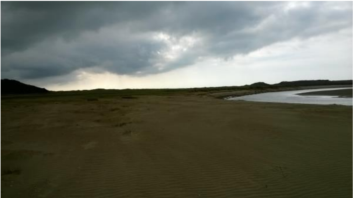
Figure 5: The low sandflat with sand couch grass and the encroaching channel at the south west end of the Cefni saltmarsh, looking west on 28 th August 2016.