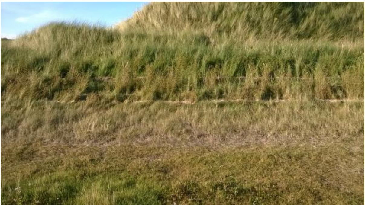
Figure 20: The fringe of sand couch grass can be narrow if the backing dune is steep. The two drift lines seen in Figure 10 photo are also clear in this view. Braich Abermenai on 29 th August 2016.