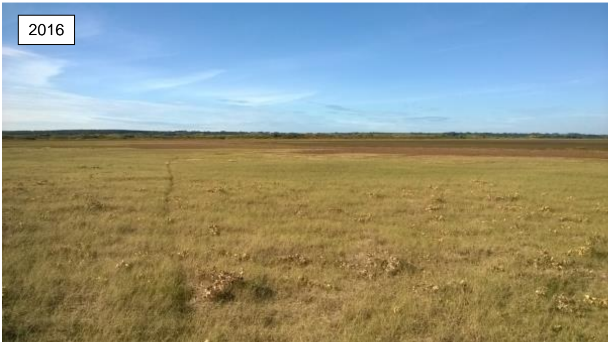
Figure 17: The east end of Penllyn Pysgod photographed on 29 th August 2016 and nearby in August 2010 showing very little change in habitat.