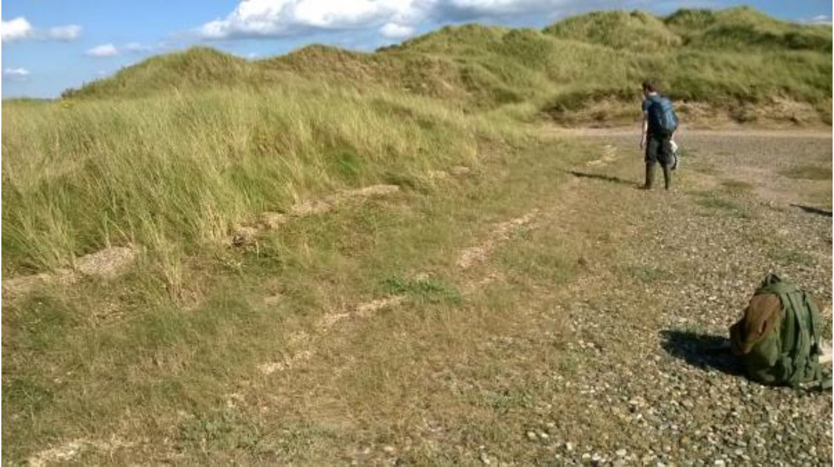
Figure 10: Sand couch grass backing Braich Abermenai dunes on 29 th August 2016. Note the two drift lines indicating that the habitat is inundated by spring tides.