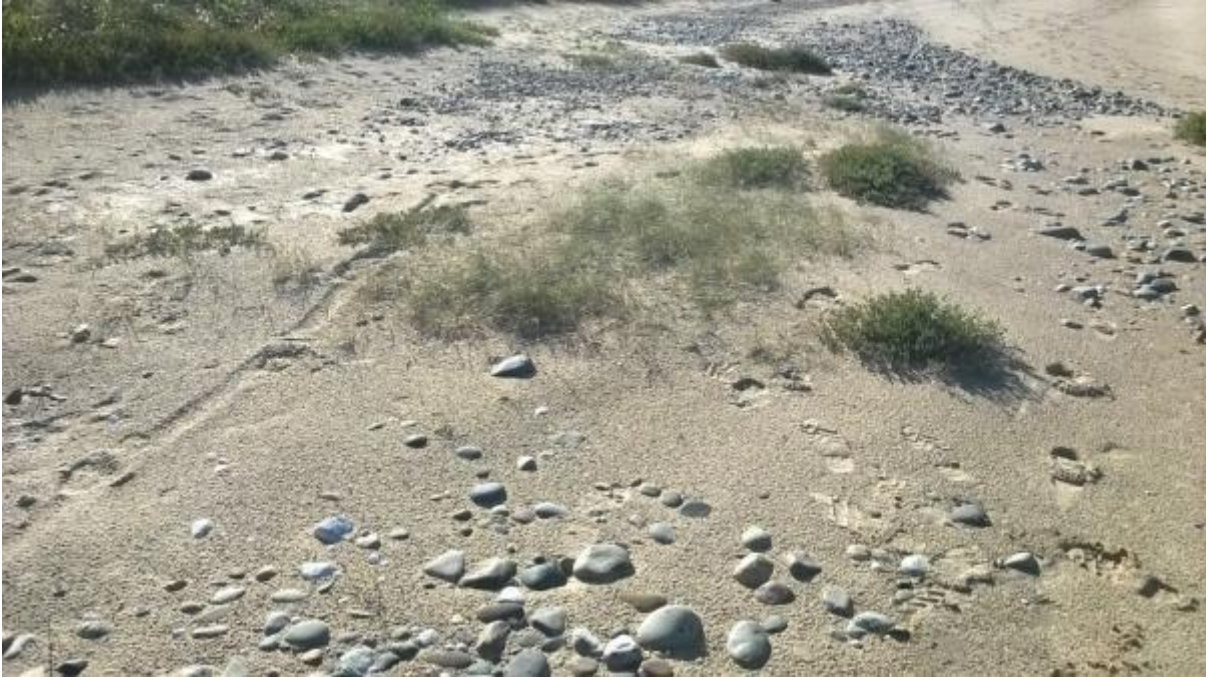
Figure 13: Sand couch grass colonising a new sand mound behind Braich Abermenai on 29 th August 2016.