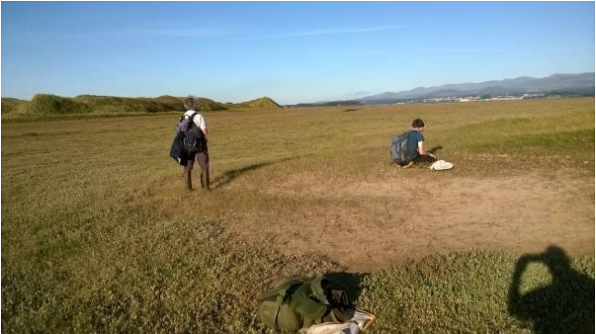
Figure 19: Water movement has kept the area of sand around this mound open in Penllyn Psygod on 29 th August 2016.