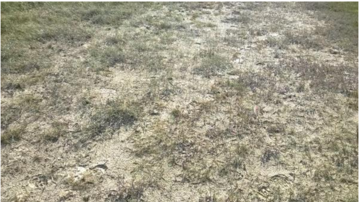
Figure 11: A deposit of fine silt may be left by the sea when it covers the sand couch grass, as here at Penllyn Pysgod on 29 th August 2016.