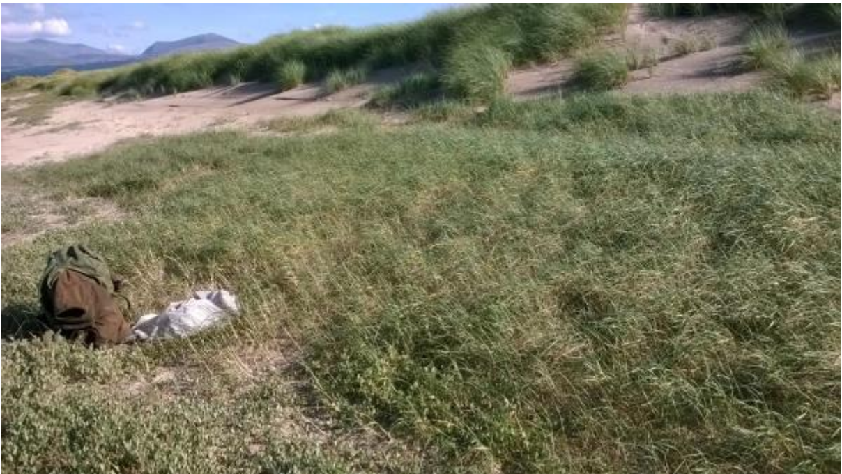
Figure 14: Tall sand couch grass at the back of Braich Abermenai on 29 th August 2016.