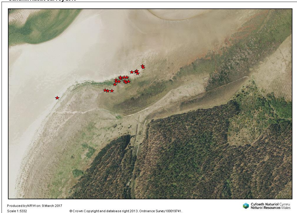
Figure 4: The distribution of Sandhill Rustic on Cefni Dunes & saltmarsh, Newborough Warren in 2016.