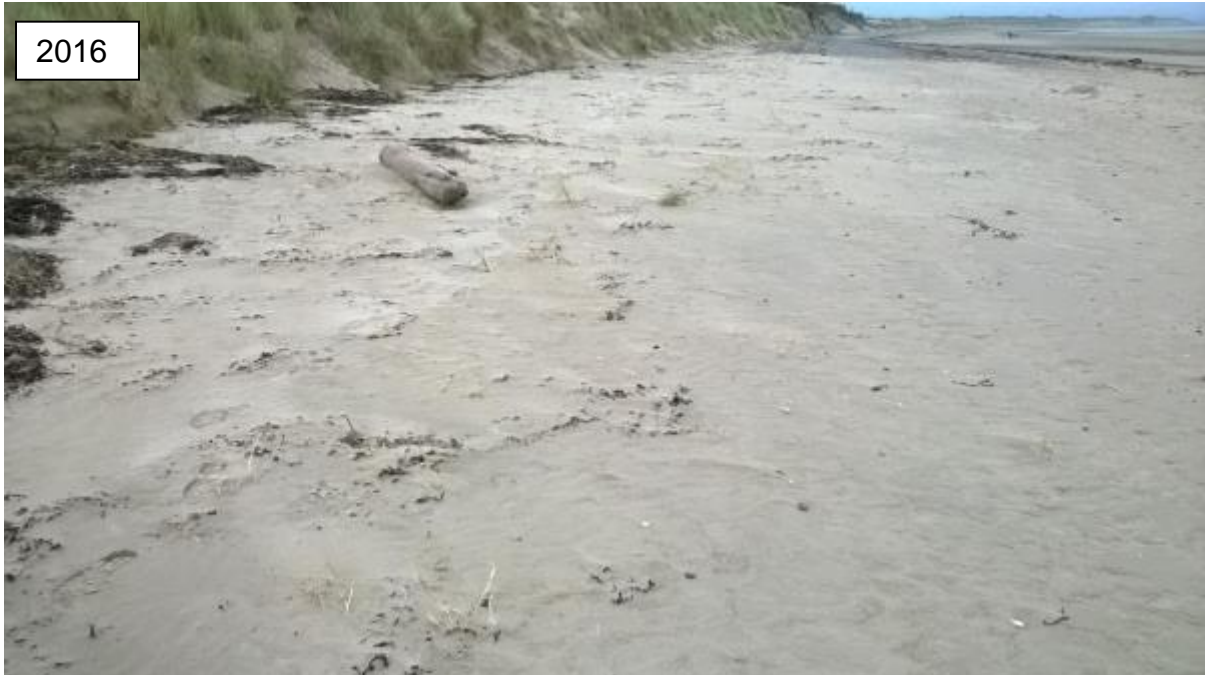
Figure 23: Seaward facing area at Ro Bach looking east on 31 st August 2016. A few straggly rhizomes of sand couch grass remain, but the fore dune photographed in August 2010 which supported Sandhill Rustics has gone and the dune edge is generally much steeper.