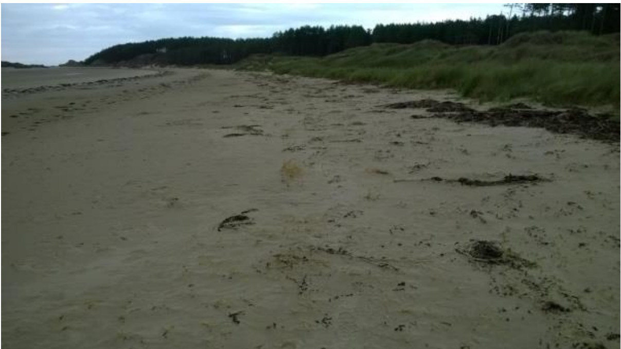
Figure 22: The fore dune has been less damaged the nearer you get to Llanddwyn Island and the grass seems poised to re-establish a fore dune from remaining rhizomes. The rear parts of the fore dune seem to have been unaffected but the rhizomes may be too deep to support caterpillars. Photographed on 31 st August 2016.