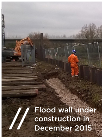
Flood wall under construction in December 2015

In our November / December issue of the Roath Flood Scheme News we reported that construction of the first phase of the Roath Flood Scheme had begun.