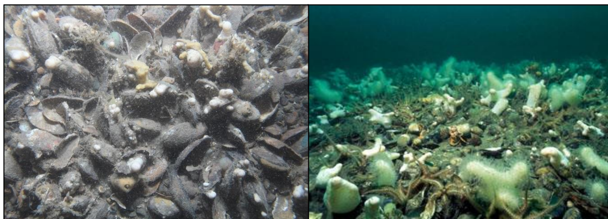
Figure 1. Plan view of M. modiolus bed, with Alcyonium , sponges and epifauna (left); view across M. modiolus bed, indicating topographic complexity and dense epibiota

The composition of the bed-forming biotopes is variable and is influenced by water depth, degree of water movement, substrate, and density of the horse mussels. These beds support a wide range of epifauna such as sponges, ascidians, soft corals, anemones, hydroids, bryozoans, tubeworms, brittlestars, urchins, starfish, barnacles, crabs and other decapods, whelks and other gastropods, scallops and fish, and there may be coralline algae and other red seaweeds in shallower areas. They can support a diverse infauna with niches for high numbers of crevice-living species, predators and scavengers (Rees et al. , 2008). The infauna often includes the purple heart urchin Spatangus purpureus and numerous bivalve species.