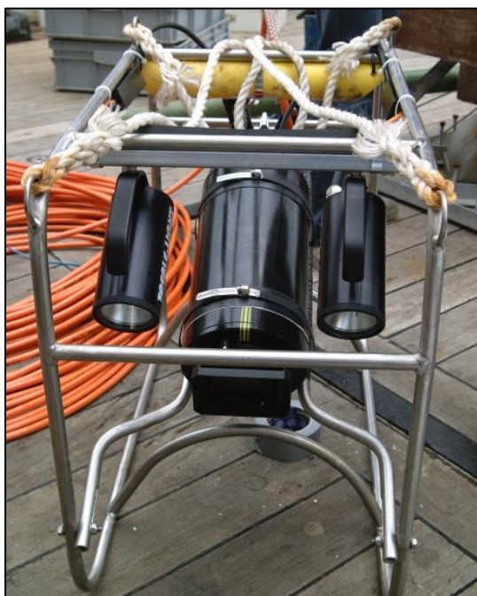
Figure 4: Drop down video sledge ready for deployment (from Ramsay et al. in draft)

Underwater imagery taken along transects (as opposed to point-based sampling) will provide additional habitat/biotope extent data and enable any small-scale habitats outside the target habitat (such as rock outcrops) to be identified.