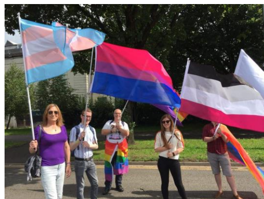
Flags left to right: Transgender, Bisexual and Asexual