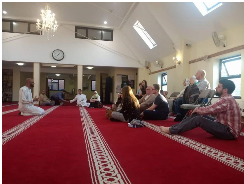
NRW staff visit a local Mosque

61. In 2018 we took a small group to a local Mosque which ran a project called 'Come Dine with Us' where NRW employees received a tour of a Mosque, gained a brief understanding of Islam, heard the Adhan (call to prayer) and then got to break the fast with food in the month of Ramadan.