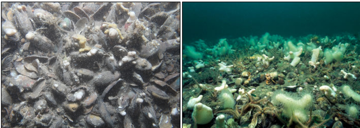
Figure 1. Plan view of M. modiolus bed, with Alcyonium , sponges and epifauna (left); view across M. modiolus bed, indicating topographic complexity and dense epibiota

The composition of the bed-forming biotopes is variable and is influenced by water depth, degree of water movement, substrate, and density of the horse mussels. These beds support a wide range of epifauna such as sponges, ascidians, soft corals, anemones, hydroids, bryozoans, tubeworms, brittlestars, urchins, starfish, barnacles, crabs and other decapods, whelks and other gastropods, scallops and fish, and there may be coralline algae and other red seaweeds in shallower areas. They can support a diverse infauna with niches for high numbers of crevice-living species, predators and scavengers (Rees et al. , 2008). The infauna often includes the purple heart urchin Spatangus purpureus and numerous bivalve species. Please refer to Figure 1 for example images of M. modiolus beds.