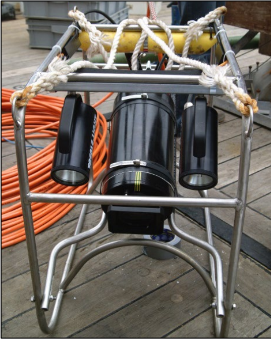
Figure 4: Drop down video sled ready for deployment (from Ramsay et al. in draft), image © NRW

With sled-mounted camera systems the optimum arrangement is to mount both a video camera and a separate still camera on the same frame, with the video facing obliquely forward and the still directly downward. The video footage provides an overview of the presence or continuity of the bed, plus an impression of the unevenness of the bed while the still camera produces a series of higher resolution images that allow accurate identification of the associated fauna (OSPAR, 2009). Video outputs can be of varying resolutions with a preference for high definition video cameras.